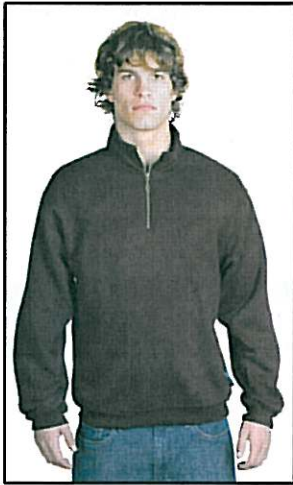
Sport-Tek® - 1/4-Zip Sweatshirt. F253

Everyone loves our 1/4-Zip Sweatshirt as a cozy layer over a t-shirt, polo or woven. Designed for lasting good looks, this sweatshirt is colorfast with minimal shrinkage.