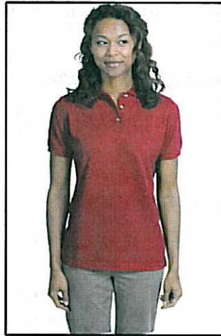
Port Authority® - Ladies Pique Knit Sport Shirt. L420

A customer favorite year after year, these sport shirts are known for their exceptional range of colors, styles and sizes. The soft pique knit is shrink resistant and easy to care for, so your group will always look its best.